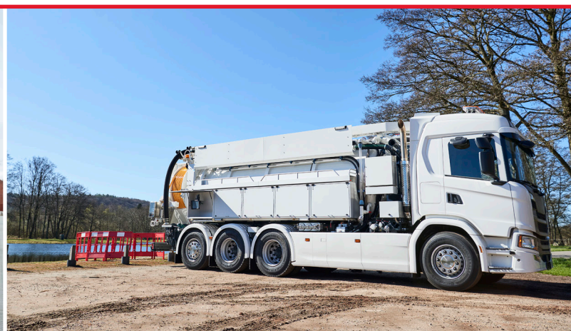
Bucher Recycler CR140 14 m 3 tank approved for 1 bar overpressure with a movable partition and 5-step continuous recycling system.