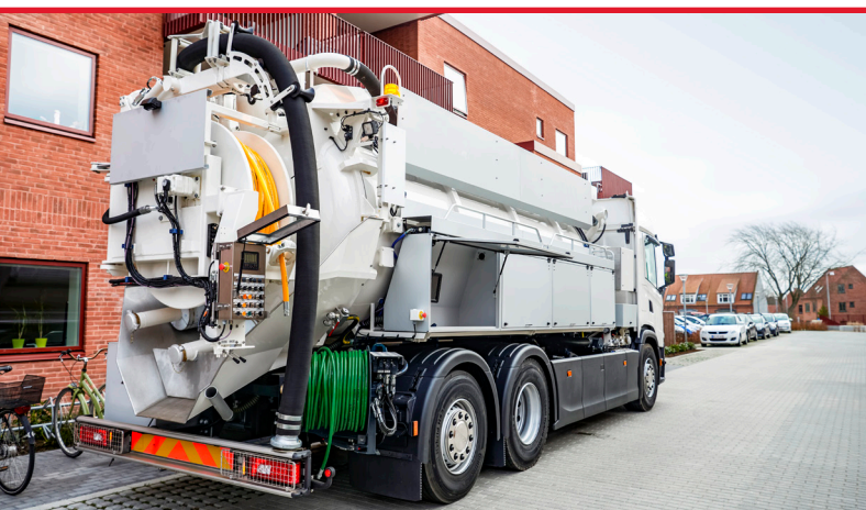
Bucher Recycler CR120 12 m 3 tank approved for 1 bar overpressure with a movable partition and 5-step continuous recycling system.

The movable partition and the world-leading recycling system provide the means to increase efficiency in jetting, water-filling, and driving by up to 55%. Being able to turn off the recycling system and use the unit as a conventional combination system adds an extra to the efficiency.