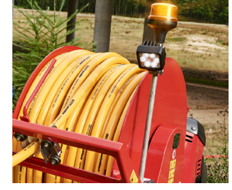
Work lamp and beacon*

Easily manage all functions thanks to the intuitive control panel.