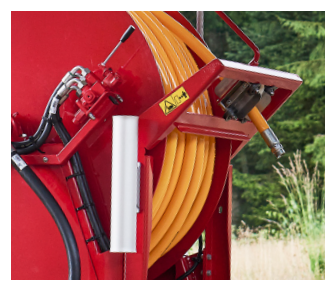
Cover hook holder*

Store your work tools on the tray and take them wherever you go.