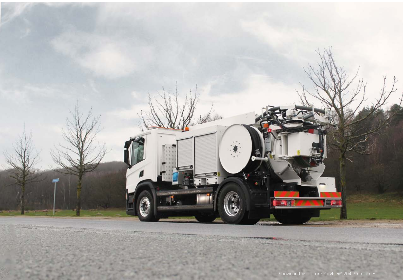
Shown in this picture: CityFlex® 204 Premium AU

For all small scale jetting and sucking tasks on densely populated areas