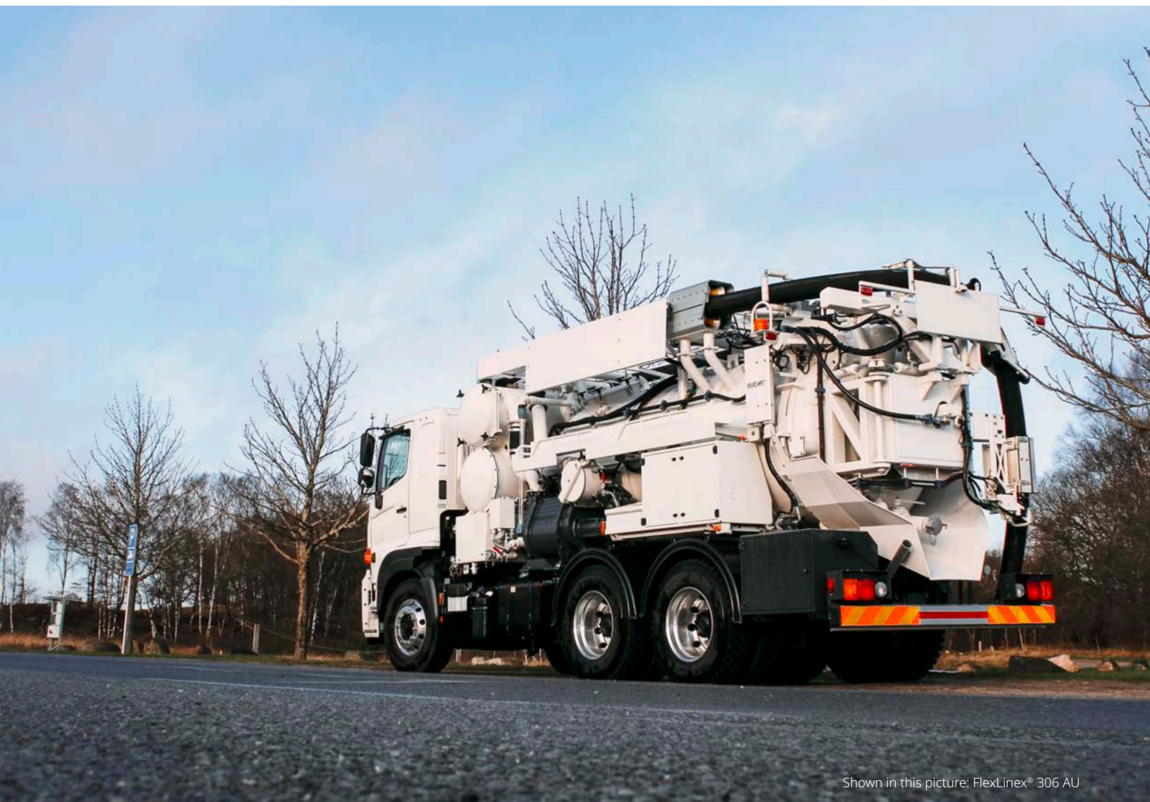
Shown in this picture: FlexLine® 306 AU

An all-round multipurpose unit tested and optimized to improve efficiency in time and fuel consumption