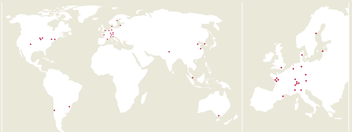
The current Bucher international locations.

refuse@buchermunicipal.com.au www.buchermunicipal.com.au