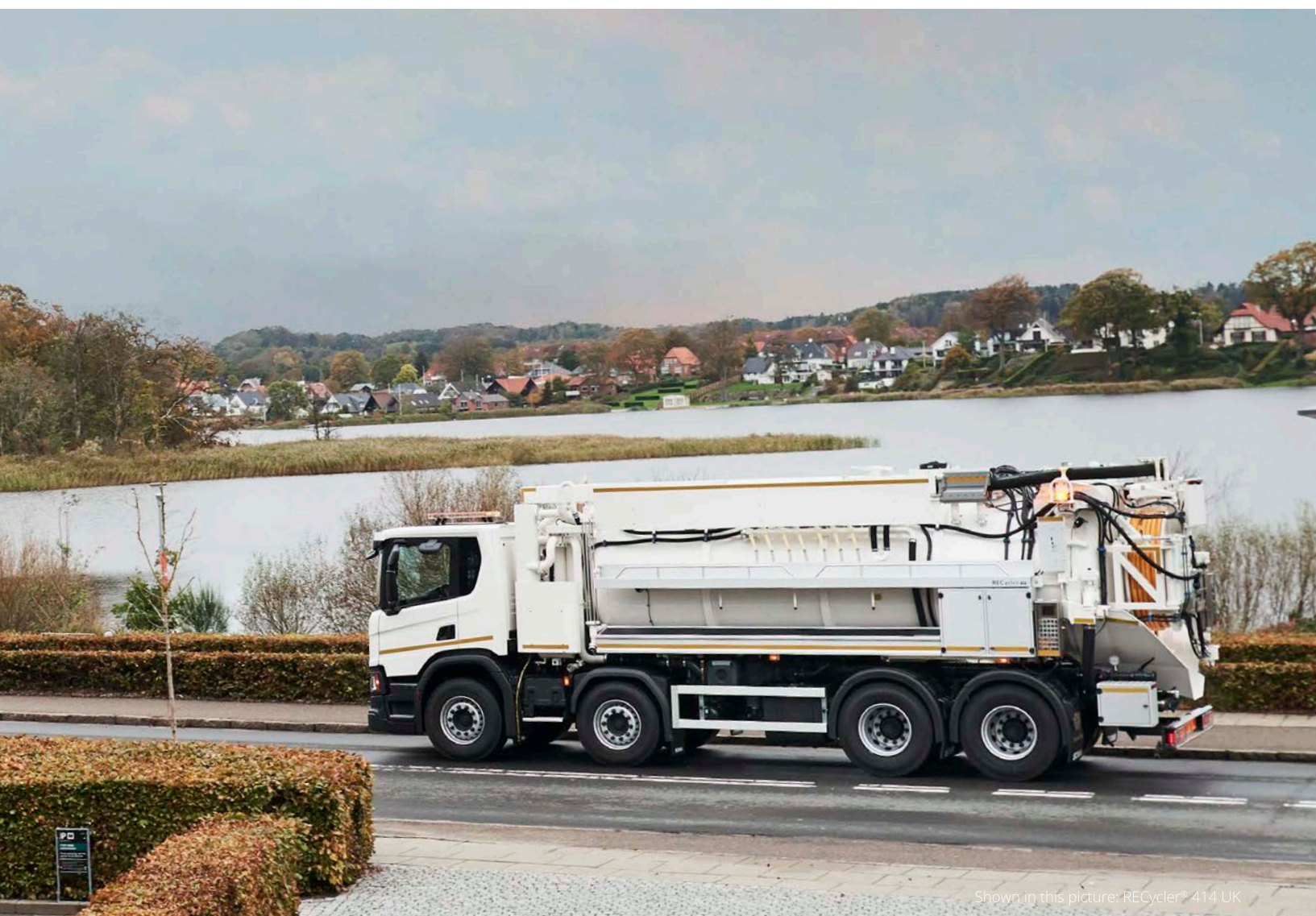
Shown in this picture: RECYCLER® 414 UK

Experience the power of continuous recycling: Increase productivity and sustainability