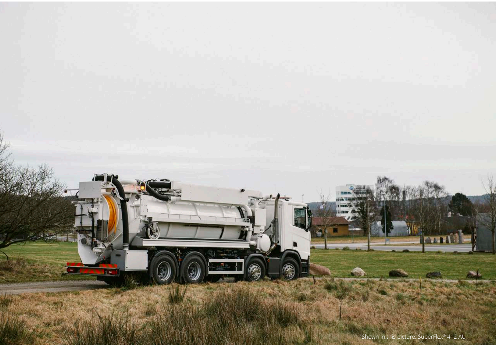
Shown in this picture: SuperFlex® 412 AU

An all-round multipurpose unit with high suction capacity. Superior to the most demanding tasks.