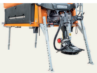
Demount system P3

Demount system with galvanized telescopic feet with crank. Higher front feet for an easy loading onto vehicles provided with side panels.