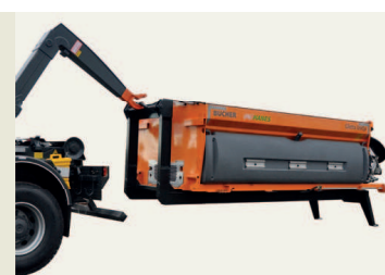
Demount system P4

P3 system reinforced for a total carrying capacity of 15 tons.