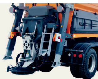
Demount system P3 / 15T

Automatic demount system for tipper, with front rollers and feet fitting into the spreader. The unloading can be done automatically from the driver's cab.