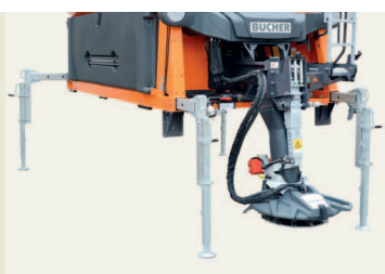
Demount system P1

Demount system with galvanized telescopic feet with crank. Higher front feet for an easy loading onto vehicles provided with side panels.