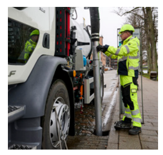
Boom Manually operated boom with 300° rotation.

Intuitive operation thanks to the push button panels and the display in the cabin.